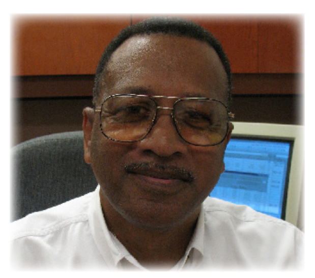
"VR evaluated the jobs here to make sure there was a really good fit. They've always been willing to go the extra mile."

By matching your workplace needs to the skills and experience you need in a new hire — and by following up with customized consultation to help ensure that your new hire is a good fit.